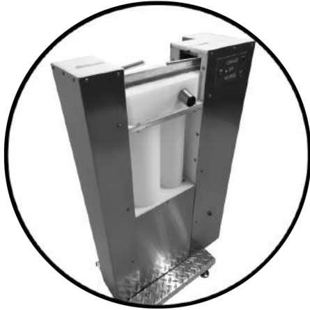
EL TORO Electric Tamale Machine