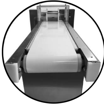
EL TORO Conveyor & Tamale Cutter